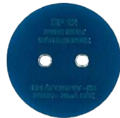
SP-12 (24VDC) Blue colored PCB